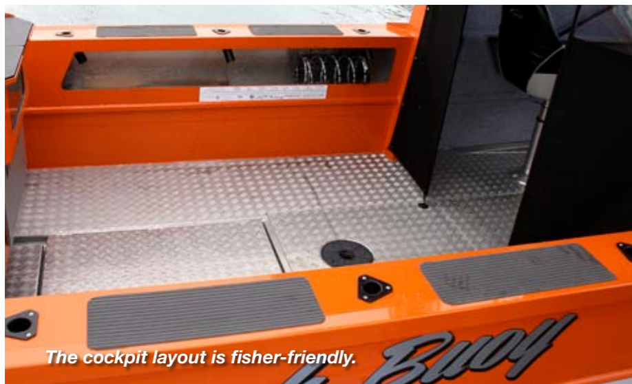
The cockpit layout is fisher-friendly.

the outboard provides access in and out of the 2600 Supercab, and there is a two-step T-bar boarding ladder. A three-step ladder is also available as an option, as too is a three-step ladder for the bow should you wish.