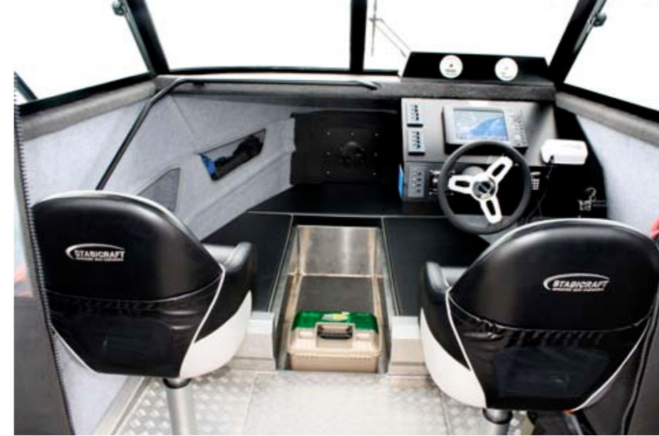
The cabin and wheelhouse are fully lined with carpet, which gives a warm and quiet feel to the boat.