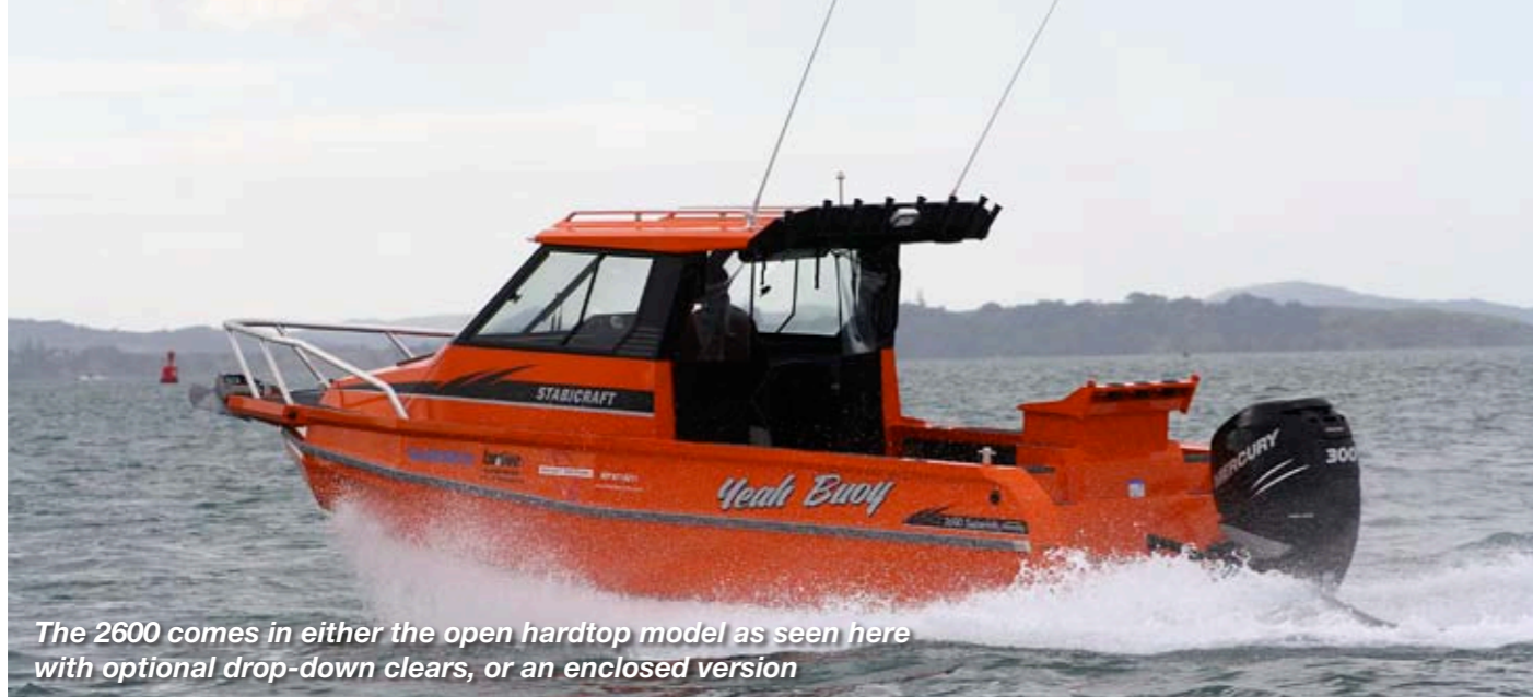
The 2600 comes in either the open hardtop model as seen here with optional drop-down clears, or an enclosed version