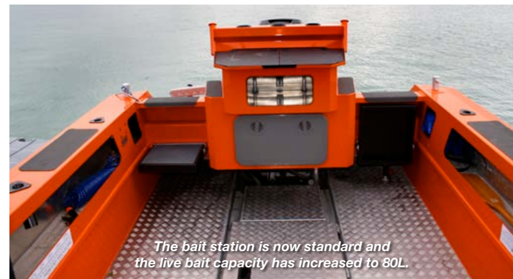
The bait station is now standard and the live bait capacity has increased to 80L.