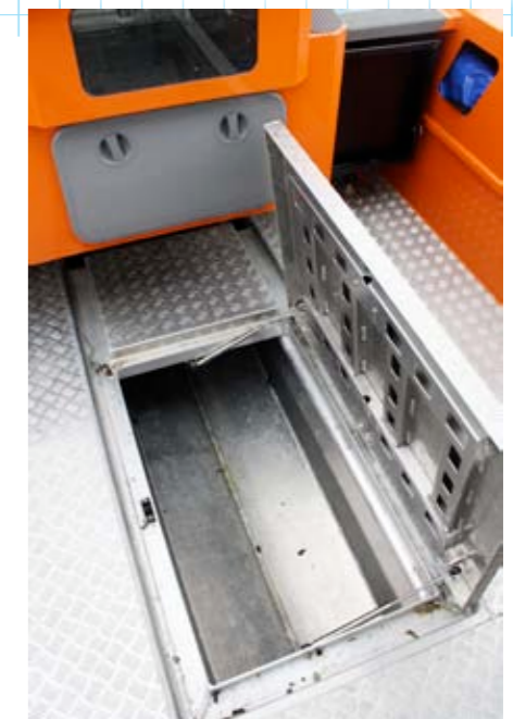
Storage is plentiful throughout, including this extra large under-floor wet bin.

you would have no hesitation in taking out to Great Barrier (this one has been out there a couple of times already).