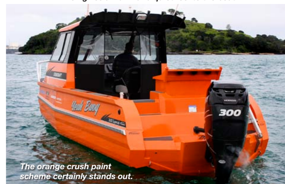
The orange crush paint scheme certainly stands out.