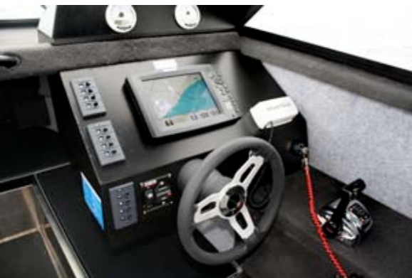
The helm area is neat and tidy and with a two-tiered configuration