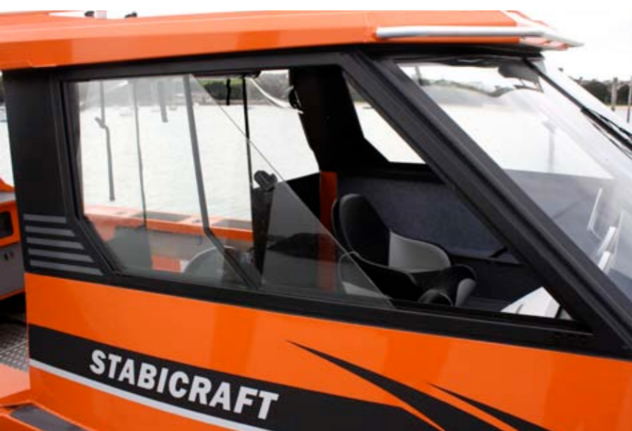
Sliding side windows allows extra ventilation

So let's get to it, what are these changes like out on the water? The 2600 has certainly benefited the most from these design changes and I must say it performed really well in the rougher conditions.